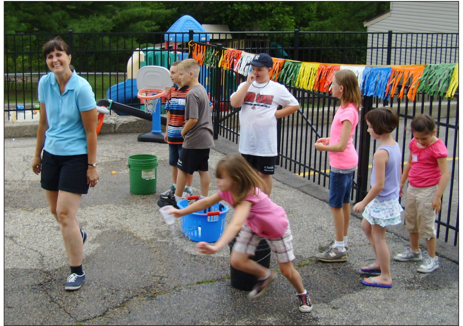
Vacation Bible School has welcomed generations of children. Everyone knows that on at least one night, the games will involve water.

(1) There is a strong desire to see the church grow and be full again. People want to reach out and reach new people, but the truth is, we don't know how to do that. The things we've tried don't seem to produce results. Nothing seems to work to actually reach people and grow the church. Several ideas were discussed in each of my sessions for moving forward from offering recovery ministries, using the van to pick kids up, offering something for battered women and/or those reentering society after time in prison, to random acts of kindness, grandparents raising grandparents classes, more technology in Sunday School and JAM (smartboards), and sports ministry outreach. We will need to determine which of these or other ideas will best serve our community and move in