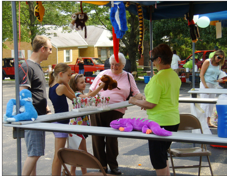
For many years, the church held a Jesus Palooza festival to welcome the community.

(1) The growing age of the church and the lack of young people. When asked what population we are not reaching, the typical response was either kids or young families. One group talked about how it was easier to reach this group of people when we had the