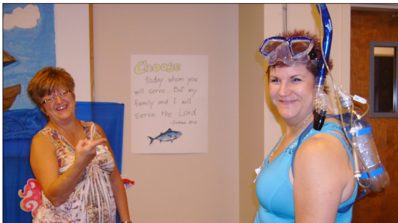
No matter what our ministry is, we love and appreciate each other and we like to have fun!

that direction. Key will be moving outside the church to where the people are and doing ministry there, not expecting them to come to us.